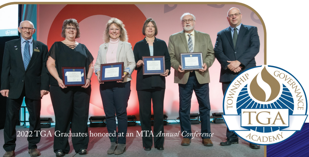
2022 TGA Graduates honored at an MTA Annual Conference

Step 5: That's it, you did it! We'll recognize your accomplishment on the main stage at our Annual Conference & Expo and provide your TGA credential.