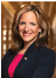
Jocelyn Benson (D)

To introduce our members to the 2026 Michigan gubernatorial candidates, and to give township officials better insights into how those candidates feel on a variety of township-related issues, MTA asked the major party candidates running for governor in the August primary questions on issues of importance to local government. The following are their responses, as submitted.