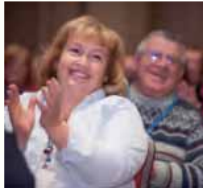
More than 60 educational sessions to choose from and dozens of speakers to share their expertise