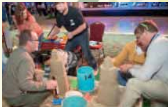
Team building and a little competition at Par Plan's Beach Party Fun Night