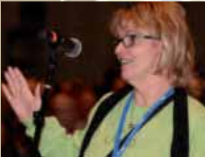
Attendees debated MTA legislative policy at the Annual Meeting