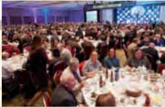
The annual MTA Banquet allowed Conferencegoers the chance to mingle while dining