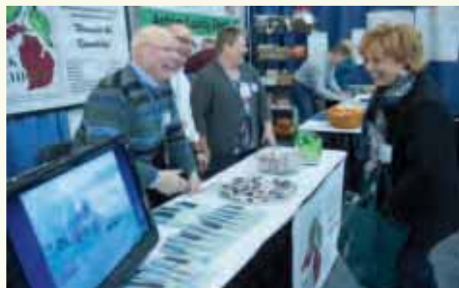
The MTA Expo connected attendees with more than 100 vendors offering township solutions and services. They also learned about the region and entered to win numerous giveaways provided by Grand Traverse and Antrim Counties' Host County Chapter booth.

Photos by Trumpie Photography. To view or order online, visit www.trumpiephotography.com .