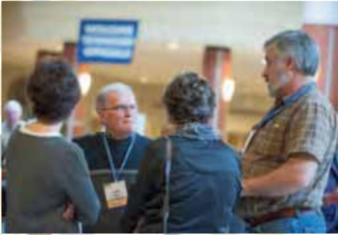
Networking time between sessions and events