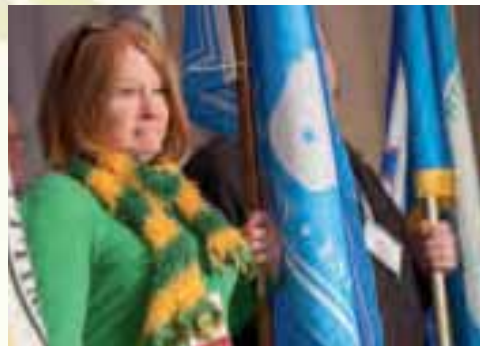
The Parade of Flags offered an inspirational start to the Conference