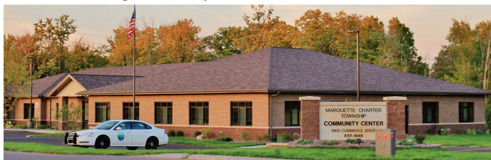
Photos and information courtesy of Marquette Charter Township (Marquette Co.)